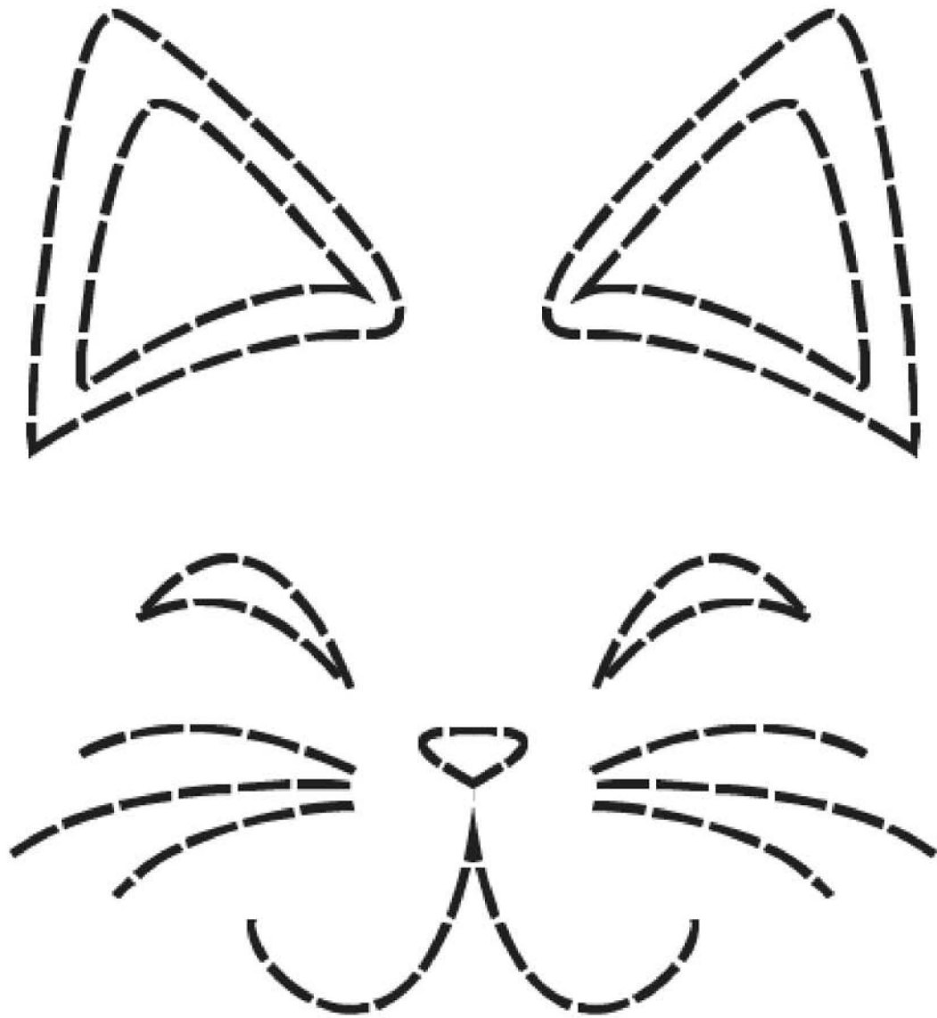
Pumpkin Cat Stencil